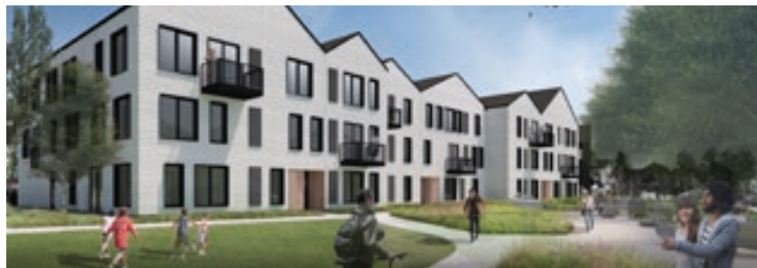
CloudTen now oversees day-to-day management of Killian Pacific’s Ninebark, a sustainably designed community Clark County, Wash

Founded by the principals of San Diego-based Sunrise Management, CloudTen Residential was formed in the wake of the COVID-19 pandemic to provide a more streamlined, customized and tech-driven approach to multifamily management.