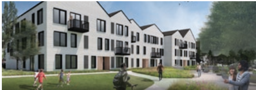
CloudTen now oversees day-to-day management of Killian Pacific’s Ninebark, a sustainably designed community Clark County, Wash

Founded by the principals of San Diego-based Sunrise Management, CloudTen Residential was formed in the wake of the COVID-19 pandemic to provide a more streamlined, customized and tech-driven approach to multifamily management.